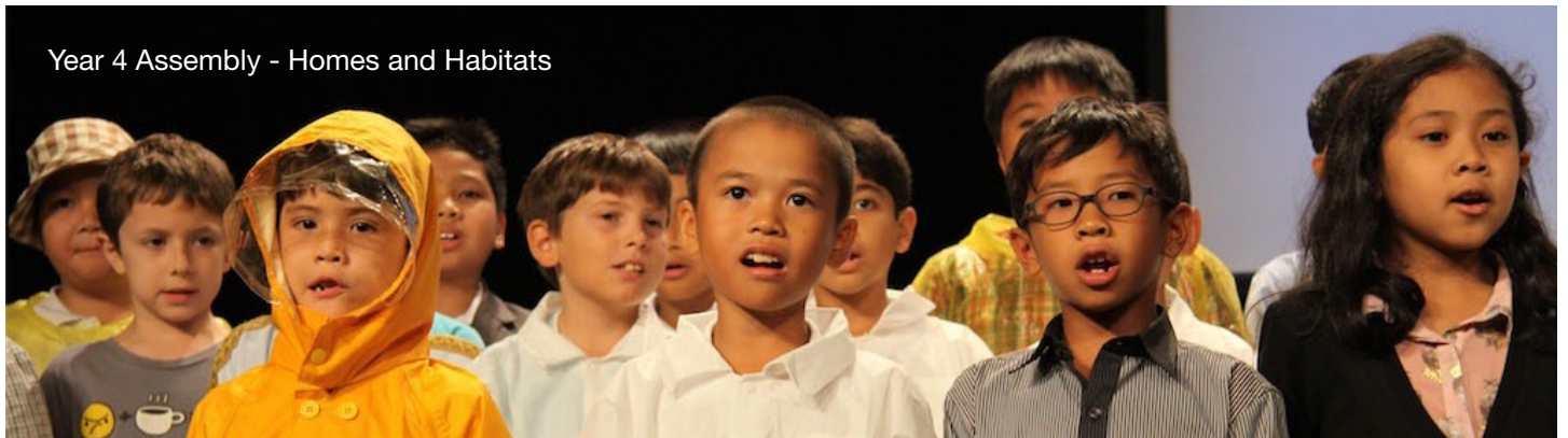
Year 4 Assembly - Homes and Habitats

From 9am on the 15th November to 9am on 16th November our school is hosting the first KL 24 Hour Run to Stop The Traffik. This is a growing movement involving thousands of activists around the globe who give their time and energy to fight human trafficking by creating change and awareness in their community and beyond. In conjunction with the 24 Hour Race, RTST KL will be hosting a carnival on the November 15th from 10am to 6pm at Nexus International School. Please note, tickets will not be on sale at the entry gate.