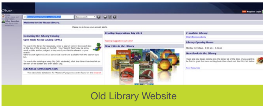
Old Library Website

Nexus International School, Putrajaya The Global Citizens of Tomorrow