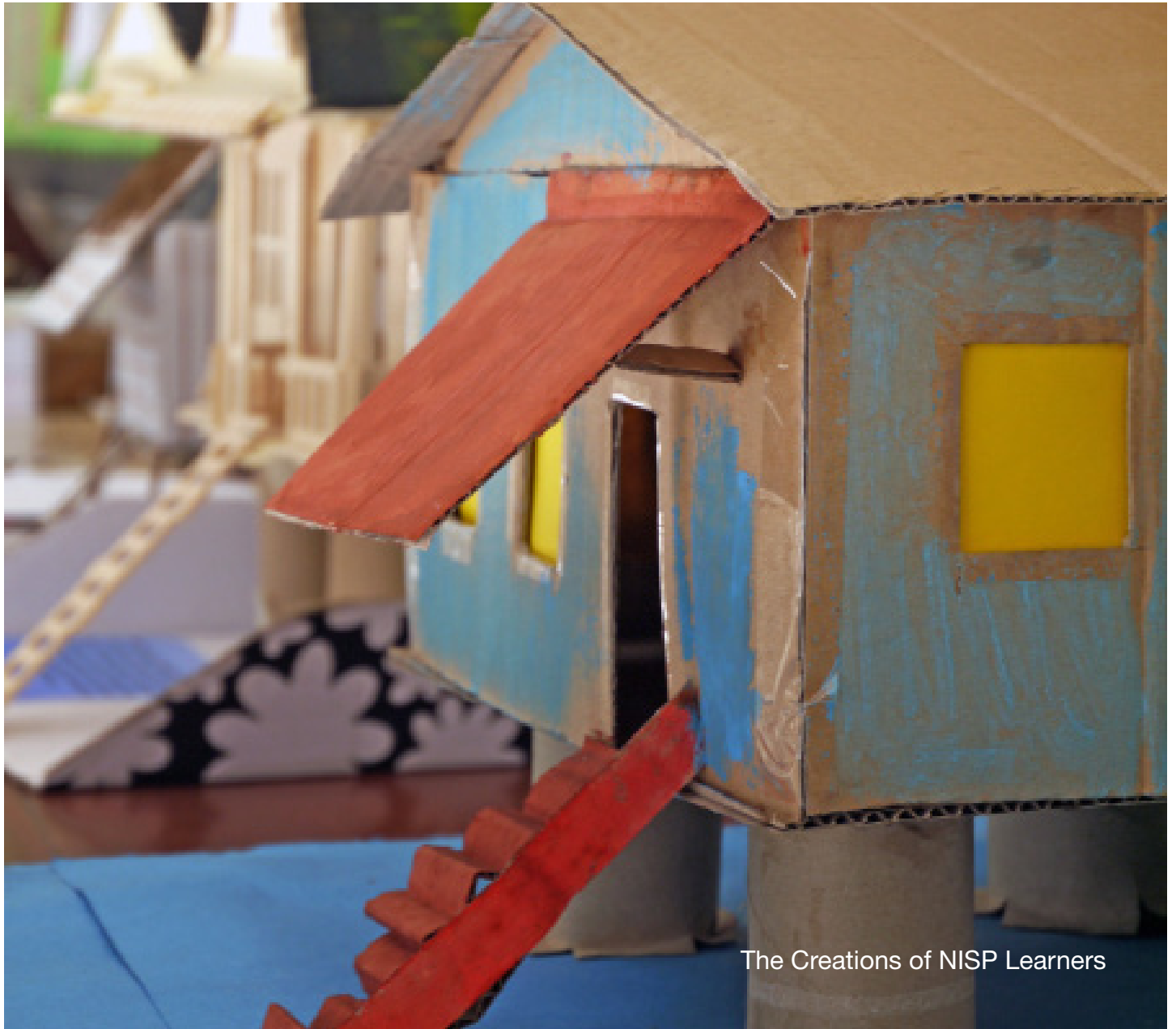
The Creations of NISP Learners

Thank you to all the parents and drivers who have acted to make our pick up time run quicker and safer by not parking in the marked areas. Our Security officers do a good job of making sure the parking and traffic runs smoothly and we would ask all drivers to please be courteous and respectful of the job that they do.