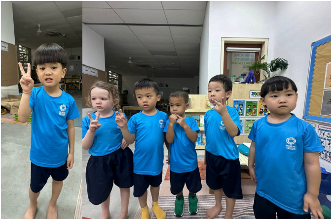
Our youngest new learners in Early Years